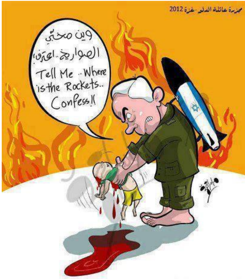
Figure 2. An image of Israeli Prime Minister Benjamin Netanyahu torturing a Palestinian baby tweeted by Hamas' Alqassam Brigades on November 19, 2012. An example of overt propaganda frame.