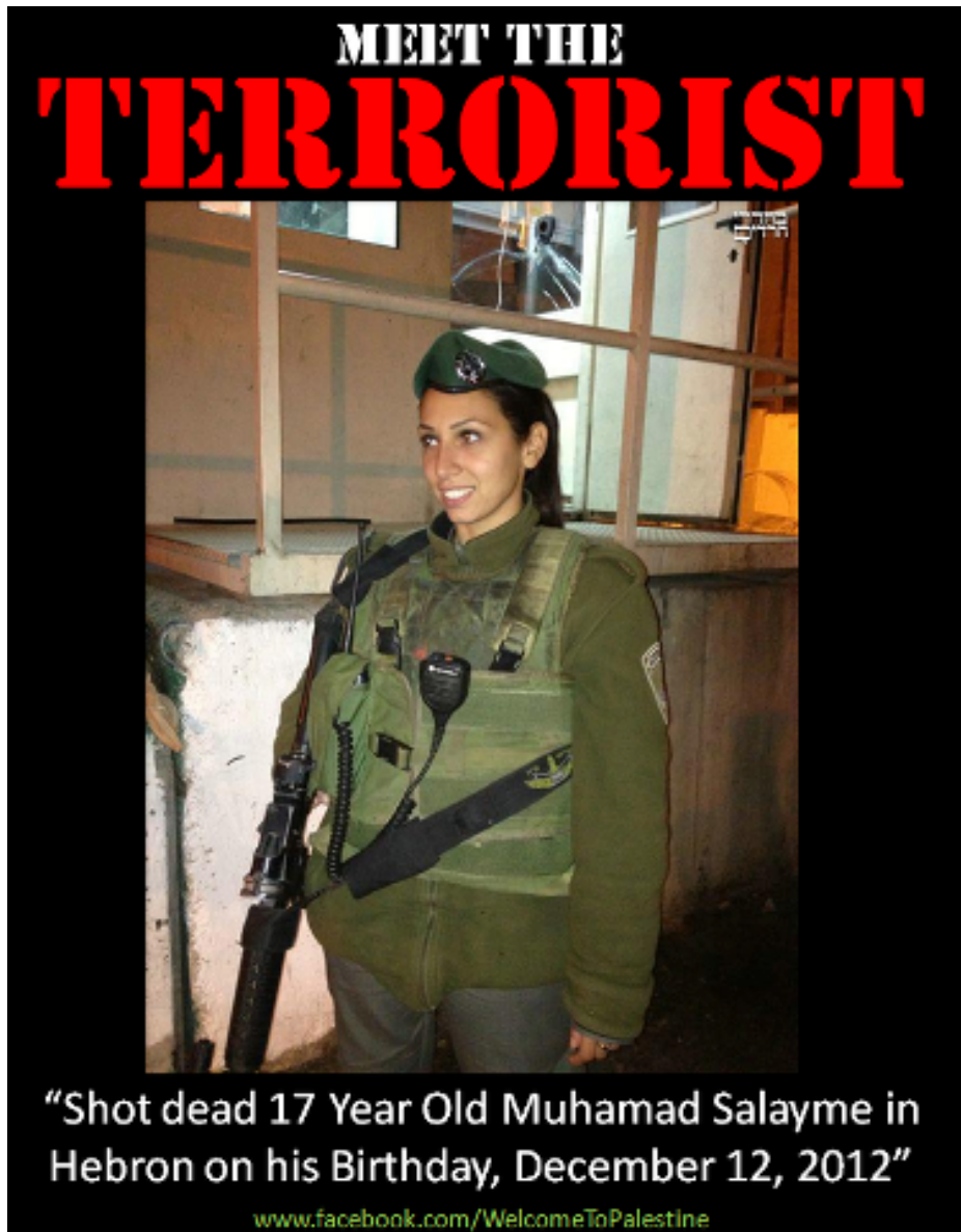
Figure 3. An image of an Israeli female soldier who allegedly killed a Palestinian minor.

Tweeted by Hamas' Alqassam Brigades on December 15, 2012. An example of resistance theme.