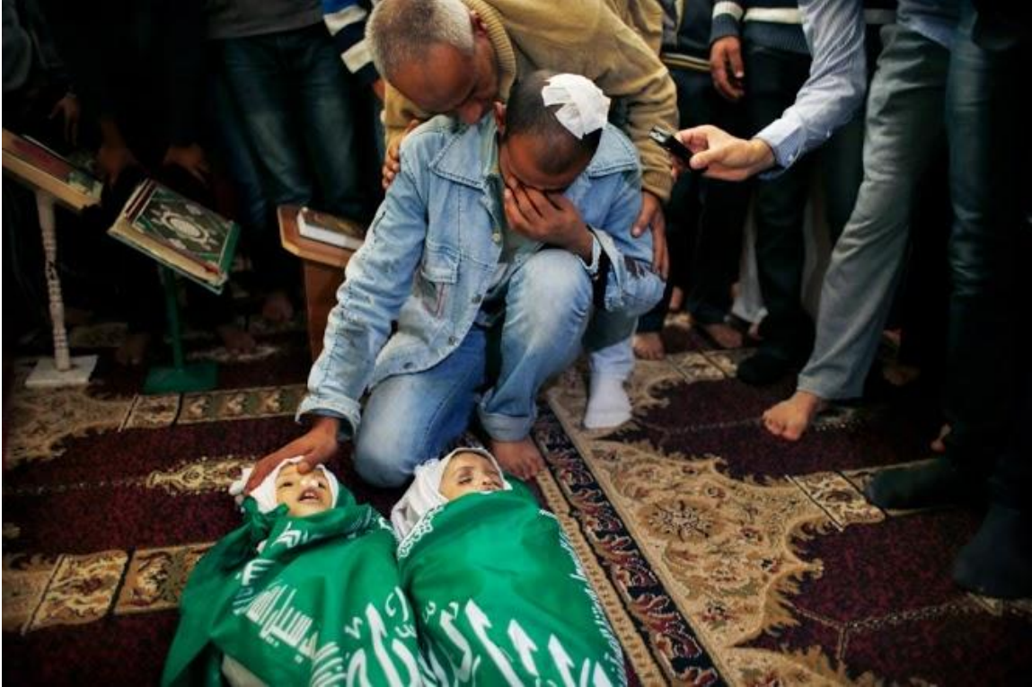
Figure 4. An image of a Palestinian parent whose children were killed during an Israeli airstrike tweeted by Hamas' Alqassam Brigades on December 12, 2012. An example of emotional propaganda frame.